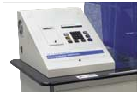
The Omegameter 600SMD is designed for simple, user-friendly operation.