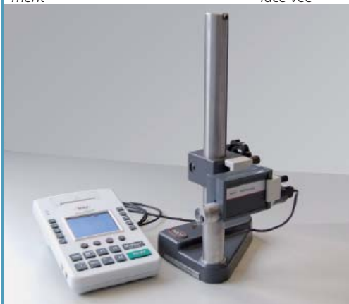
MarSurf M 300 C on measuring stand ST-D