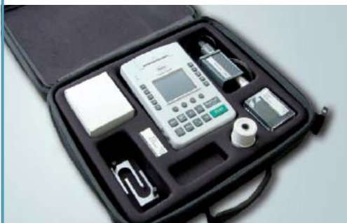
MarSurf M 300 C set