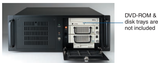
DVD-ROM & disk trays are not included