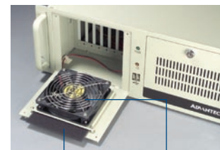
Easy-to-replace cooling fan and filter One 12 cm / 85 CFM cooling fan